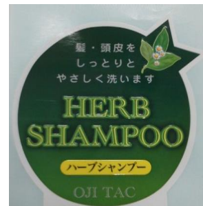
Embossed label by POC20 sticker

And it's superior to other general plastic film sticker brands in light resistance because the adhesive is UV protection type.